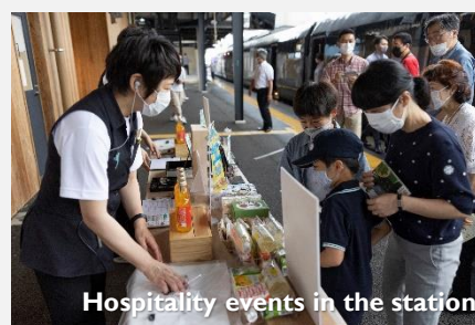
Hospitality events in the station