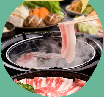
Black Pork Shabu-Shabu

kagoshima is about "kurobuta(Berkshire Pork)"! The others, there are a lot of delicious pork dishes too