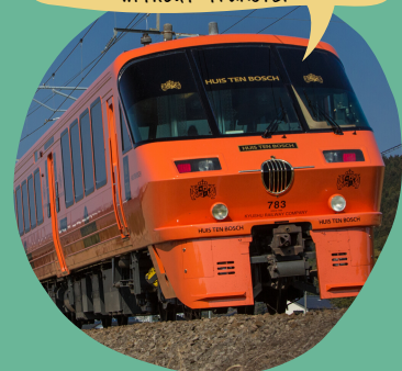
Limited Express "Huis Ten Bosch"

Operating: Hakata~Huis Ten busch You can get to hot spot in kyushu, Huis Ten Bosch directly without transfer