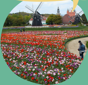
Huis Ten Bosch

Seasonal flower and romantic illumination are amazing◎ You can enjoy with friends, as well as with your lover too!