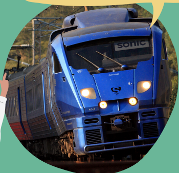
Limited Express "Sonic"

Operating: Hakata~Beppu/Oita Futuristic cool Limited Express having blue metal body!