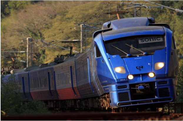
Sonic/Blue (With 7 Cars)