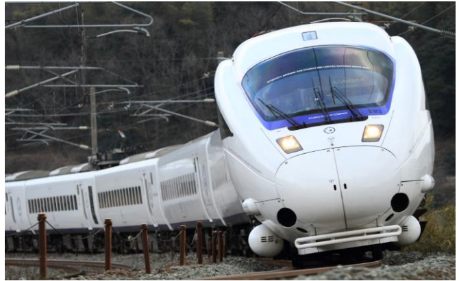
Sonic/ White (With 6 Cars)

Operation section : Hakata ⇄ Kokura ⇄ Oita*